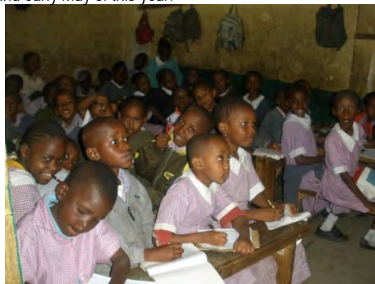
Some of the sponsored children working hard in school