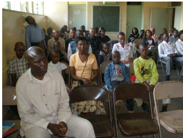
Guests listen intently to speeches given by sponsored children and learn more about Dream Sponsors program